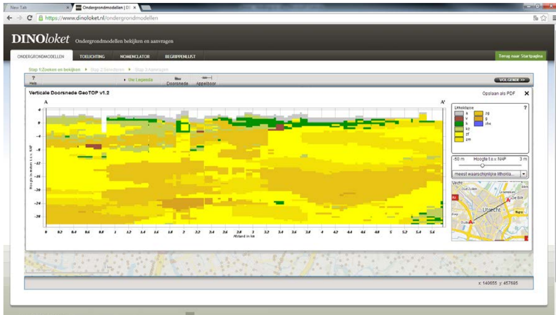
Figure 1 Predictive cross-section through Utrecht showing most the likely lithology

This paper will give an update of latest developments in modelling and delivery of 3D geological models in the Netherlands with particular emphasis on quality assurance and the visualisation and communication of uncertainty through the new release of the Dinoloket web-portal www.dinoloket.nl .